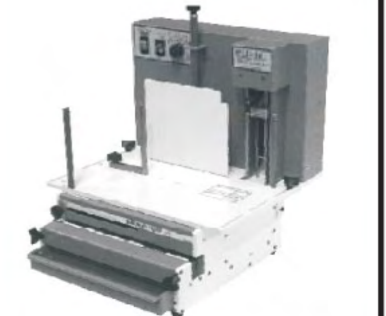
PAL-14 "Piks-A-Lift" mounted on the OD-4012 ELECTRIC PUNCH