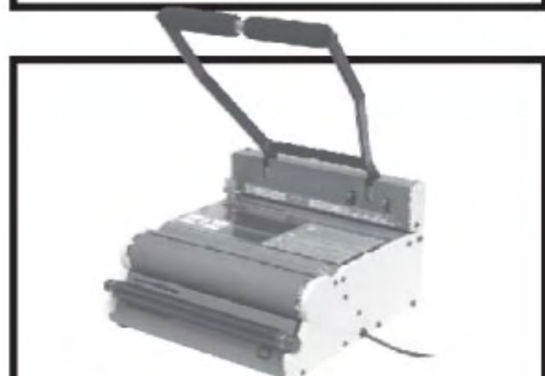
PC-248 MANUAL PUNCH AND ELECTRIC COILING SYSTEM