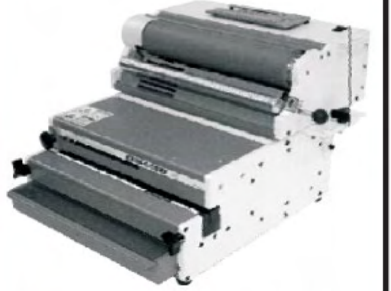
HD-4170 12" COIL INSERTER mounted on the OD-4012 11" ELECTRIC PUNCH