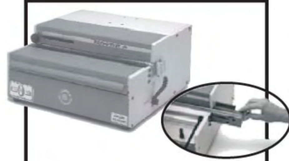
HD-7000 14" HEAVY DUTY OPEN END PUNCH