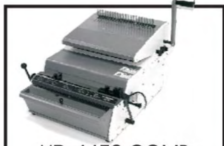
HD-4470 COMB OPENER MODULE with the HD-7700 HEAVY DUTY 14" PUNCH