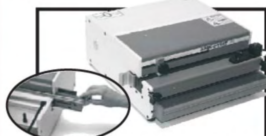
OD-4012 11" OPEN END ELECTRIC PUNCH