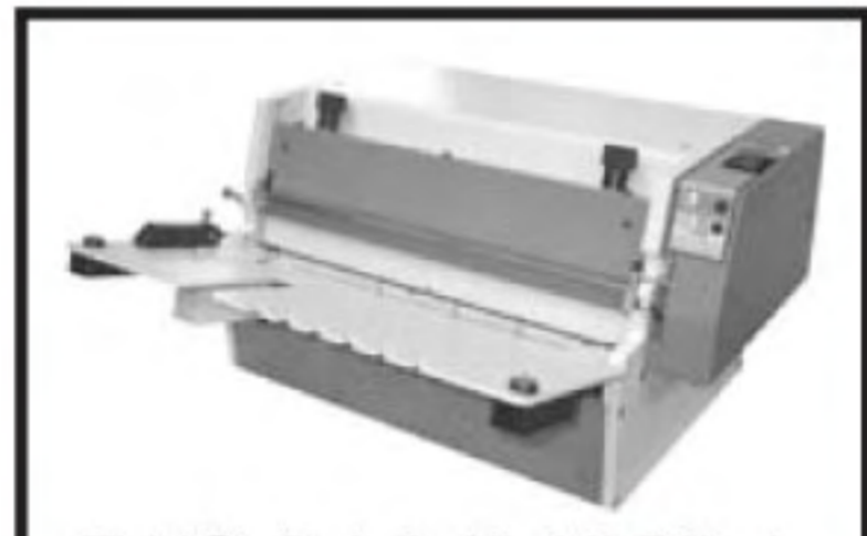
EWC-14 14" All Pitch (Shown) And EWC-24 24" All Pitch Flat Bar Wire Closer