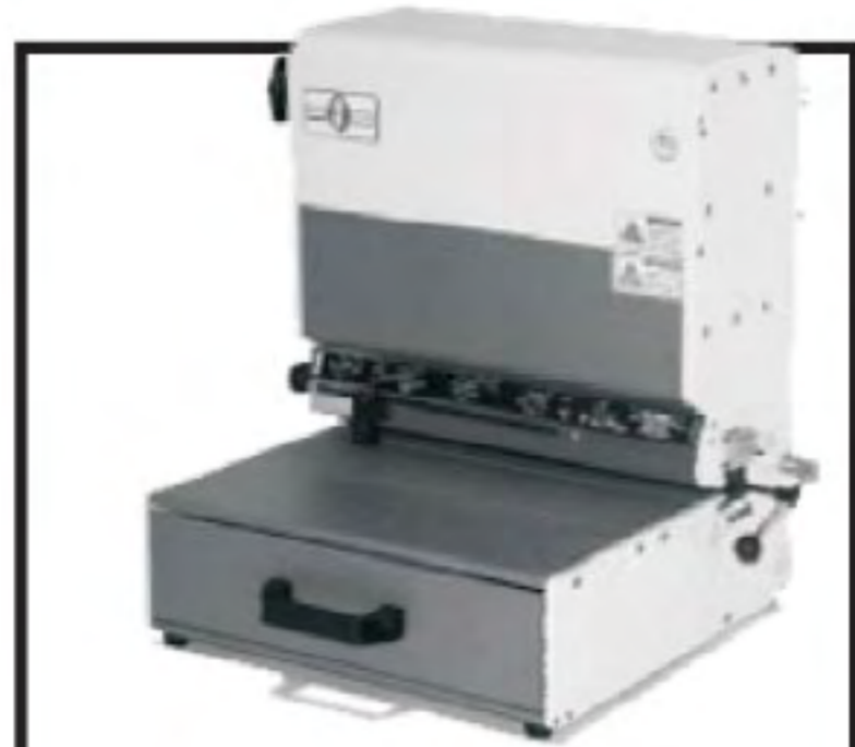
HD-7700H HORIZONTAL PUNCH