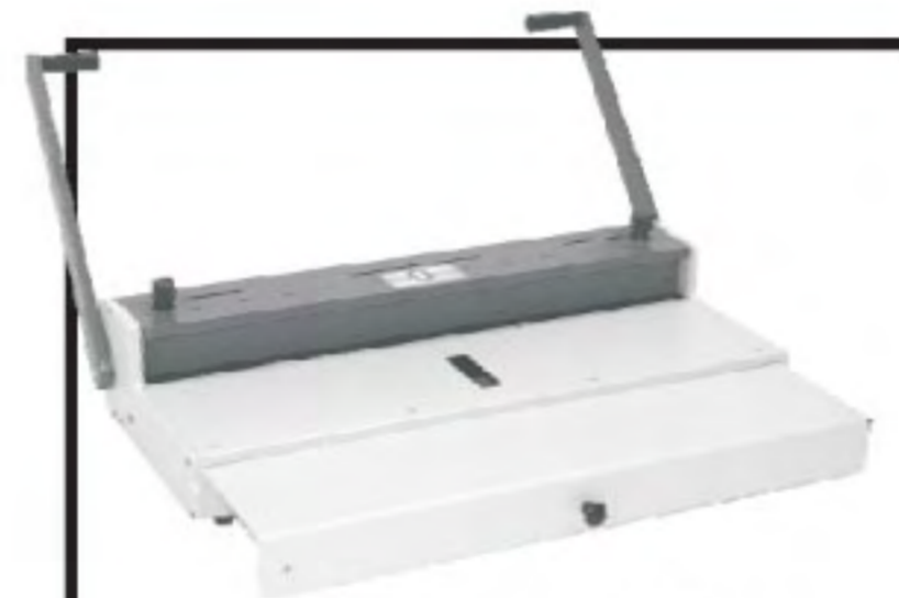
HC-8024 24" WIRE CLOSER