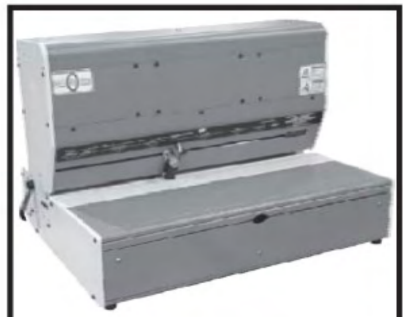
HD-7500H 24" HEAVY DUTY HORIZONTAL PUNCH