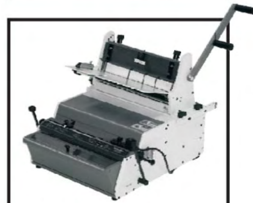
HD-8370 (3-1) shown with the HD-7700 14" HEAVY DUTY OPEN END PUNCH