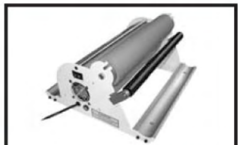
HD-e4100 Electric ECON-O-ROLL Coil Inserter