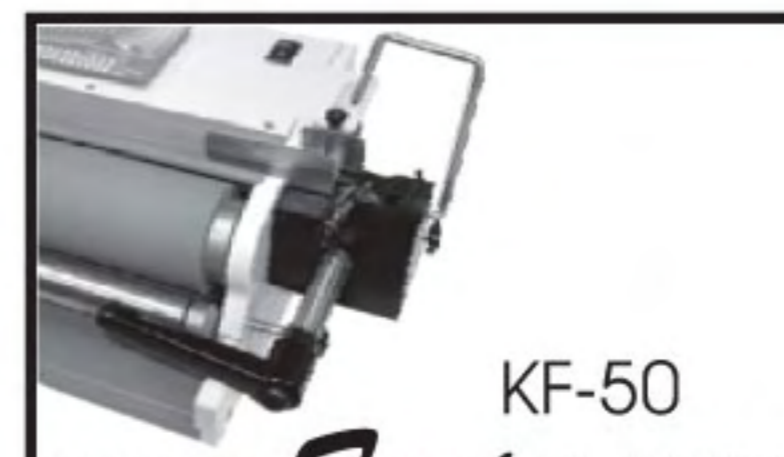
KF-50 KRIMP- Fast PLASTIC COIL CRIMPER