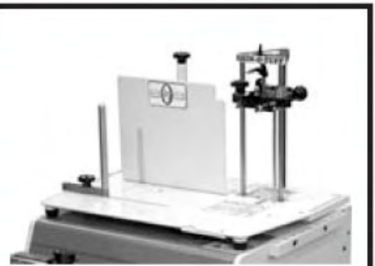
PAL-M MANUAL Piks-A-Lift