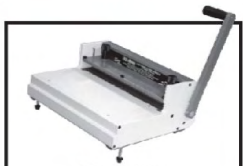
HD-8000 WIRE CLOSER