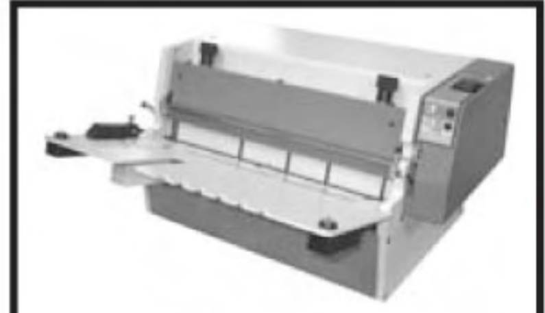
EWC-8370 Insert-A-Bind Wire Inserter/Closer