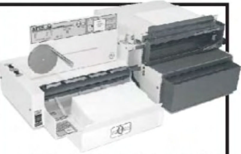
APES-14 AUTOMATIC PAPER EJECTOR & STACKER

12 Standard Punch Die Patterns Available. All Other Patterns Available Upon Request.